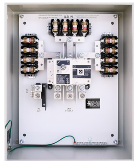
AC Combiner, 600 VAC, 4 input circuits, 200A output disconnect, NEMA-4 steel enclosure